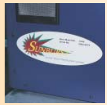
OEM Labels/Rating Plates